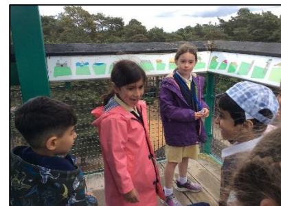
More photos available on the school website in the class pages.

On Thursday afternoon, our Year 2 pupils joined thousands of other children across the world in a live online workout with Joe Wicks. It was certainly a challenging routine but everyone loved it and felt super energised afterwards. What a brilliant thing to be part of.